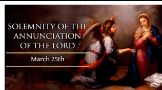
SOLEMNITY OF THE ANNUNCIATION OF THE LORD March 25th